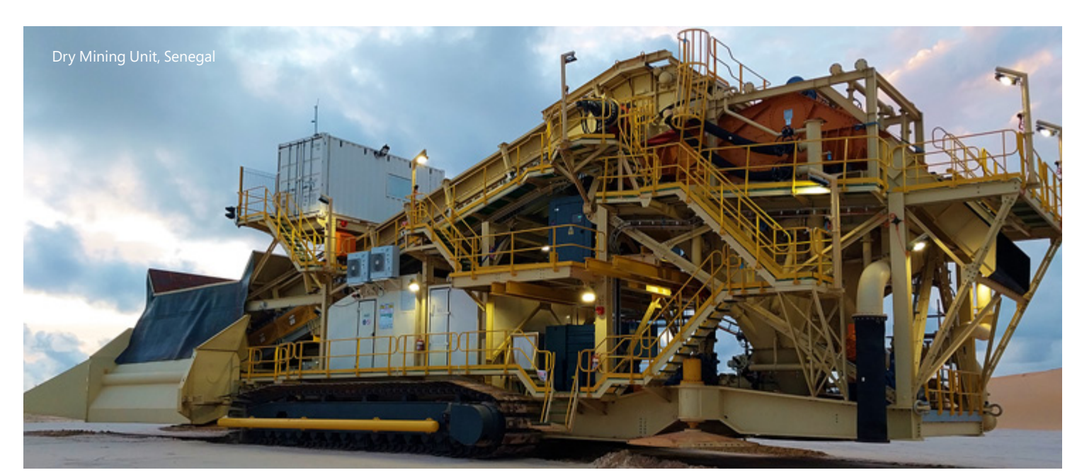
LYCOPODIUM LIMITED FY2023 FINANCIAL REPORT | 30 JUNE 2023

In Infrastructure, we continue to provide design, engineering, technical advisory and Rail Infrastructure Management (RIM) services for greenfield and brownfield rail projects across Australia. The Australian Rail Track Corporation's (ARTC) Southern Highlands Overtaking Opportunities Detailed Design package, to improve the efficiency of freight and passenger services between Sydney and Melbourne, is a significant scope of work undertaken in FY2023. Our Infrastructure business has recently been